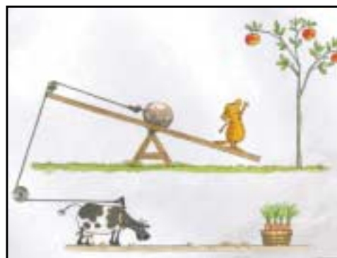
One of the puzzles (above); the title screen, below (below)