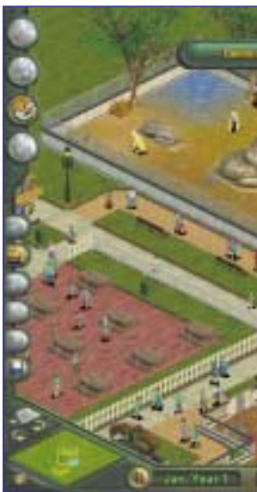
A zoo in progress in Zoo Tycoon