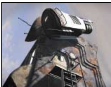
The telescope in Bioscopia (above); and one of the puzzles (below).

Jurors for this year's contest included nine representatives from the US, Germany, Italy, France, Korea, and Japan. The task was daunting—choose just four winners from 2001's batch of more than 987 products, entered from 13 different countries. Software, games and toys filled one conference room of the Bolognafiore, host of the culminating event, the Bologna Children's Book Fair, where the winners are announced each April. This forward-thinking organization decided to explore new media back in 1997, as a natural extension of the world of print. This year marks the first that e-books were also up for an award, and nearly 100 were considered for the prize. Despite language barriers and a bit of national patriotism, the jurors made their selections following three days of intense debate and demonstration. This year, there were four winners, along with five citation winners.